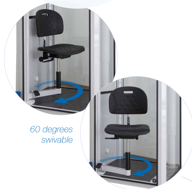
60 degrees swivable

The swivable patient chair and the extremely low door step allow even physically impaired patients easy cabin entry.